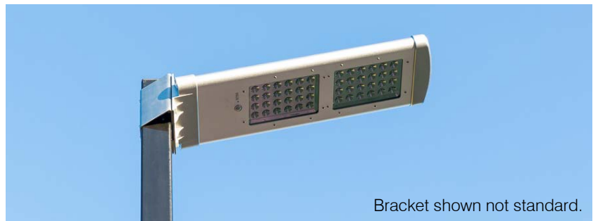
Bracket shown not standard.