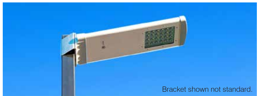
Bracket shown not standard.